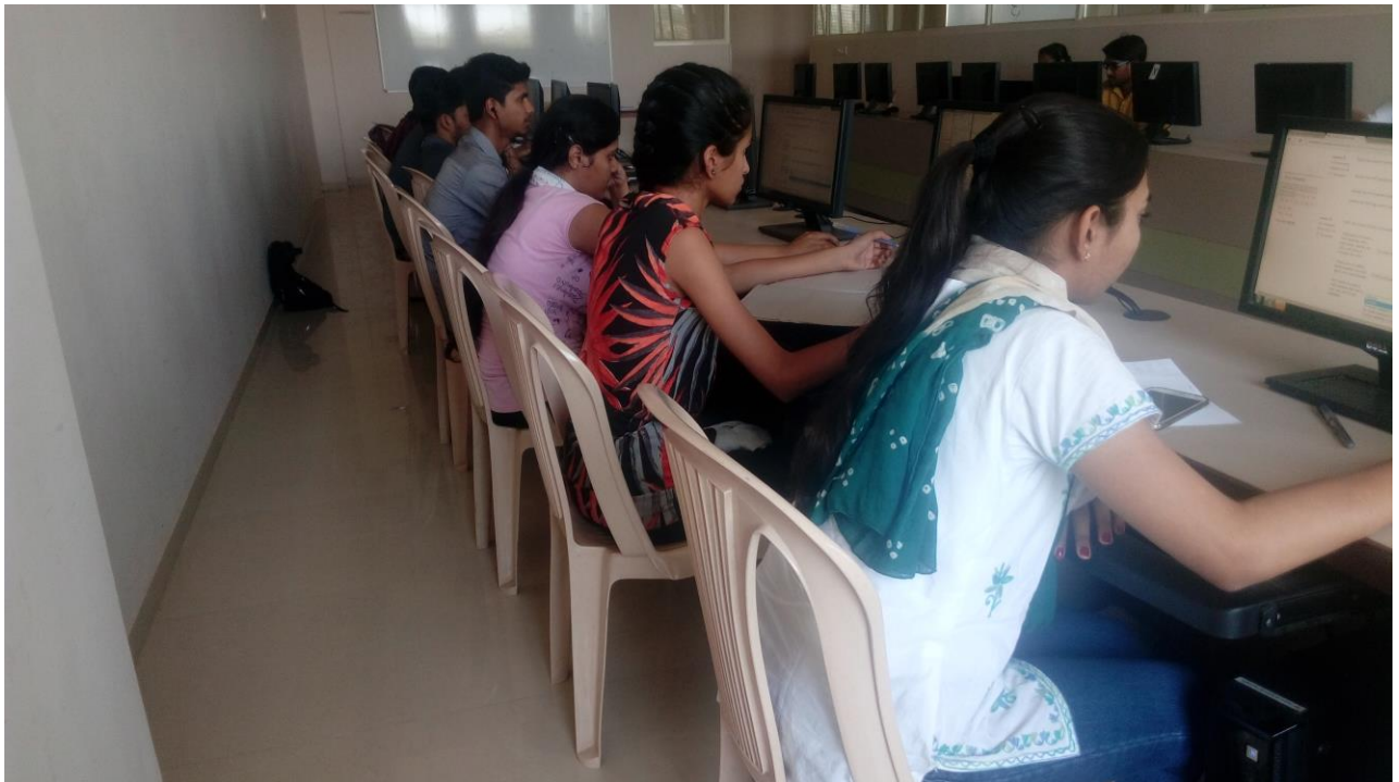
Students Appearing in Exam