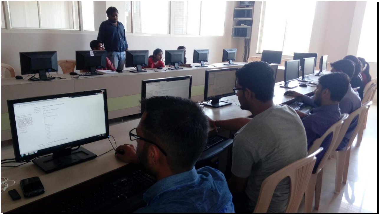
Students Appearing in Exam